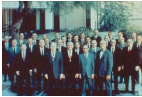
Picture of leaders