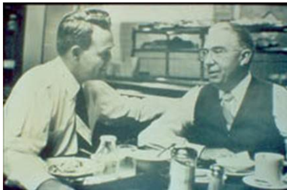
Picture of both father and son

to cut losses once it is clear that a new project will not become profitable. When Paul Galvin died in 1958 these two admonitions were part of the philosophy which he left behind.