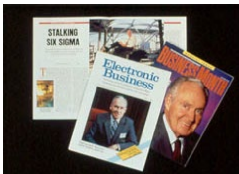
Picture of publicity

Meeting the Japanese challenge in the 1980s involved two separate issues. One was the Japanese competitors strategy of using cutting prices in the American market, keeping prices high in the Japanese market, and blocking the American competition from competing in the Japanese home market. Bob Galvin led American industry s response. That response consisted of enlisting the U.S. government in the rewriting of the rules of competition so as to eventually eliminate the Japanese home country sanctuary. The other issue with the Japanese was the fact that they had developed superior quality management tools. Bob Galvin insisted that Motorola would learn to match the Japanese. His leadership enabled Motorola to launch its then famous six-sigma quality management program. The company s success was recognized when the U.S. Government awarded Motorola one of the first Malcom Baldrige awards (U.S. President Ronald Reagan is shown here giving the award to Bob Galvin on the right).