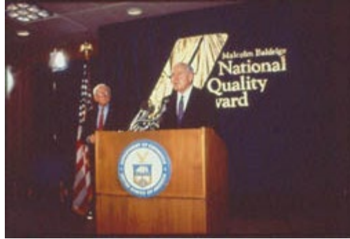
Picture of National Quality Award