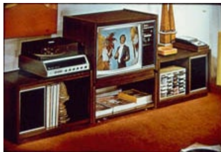
Picture of color Television