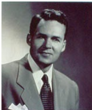
Picture of young Bob Galvin

In 1986 Bob Galvin gave up the title of CEO while remaining chairman of the board. Between 1958 and 1987 sales had grown from $ 216.6 million to $ 6.7 billion and cash flow per share had grown from 89 cents to $6.10. Five years later Bob Galvin published The Idea of Ideas (Motorola University Press, 1991). There he presented a variety of ideas which influenced his ability to lead Motorola through more than three decades of successful growth and renewal. His father's legacy figured prominently in his writing. Perhaps the most telling insight in that regard is this statement, (M)y father treated me to the most demanding discipline. He trusted me! (p.6).